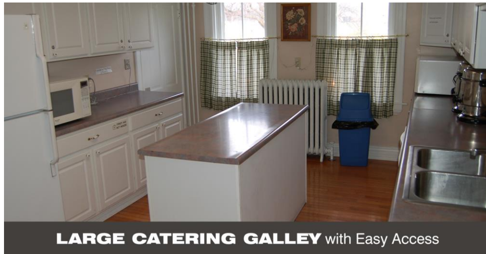
LARGE CATERING GALLEY with Easy Access

Visit Register.MiamiTwpOH.gov or call (513) 248-3727